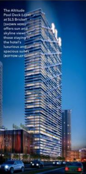
The Altitude Pool Deck (LEFT) at SLS Brickell (SHOWN HERE) offers sun and skyline views for those staying in the hotel's luxurious and spacious suites (BOTTOM LEFT).