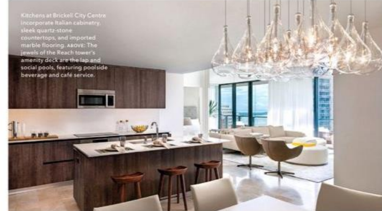
Kitchens at Brickell City Centre incorporate Italian cabinetry, sleek quartz-stone countertops, and imported marble flooring. ABOVE: The jewels of the Reach tower's amenity deck are the lap and social pools, featuring poolside beverage and café service.