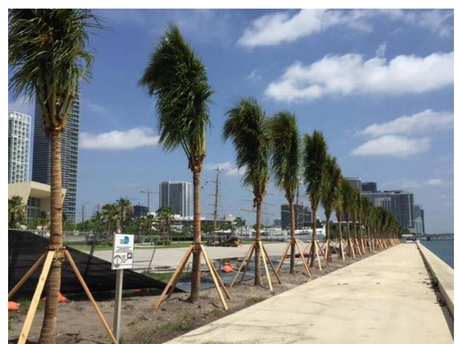
Newly planted coconut palms line the baywalk at Parcel B behind the American Airlines Arena, visible at left.

May 31<sup>st</sup>, 2017 Circulation: 86,941/ UMV: 8,942,930