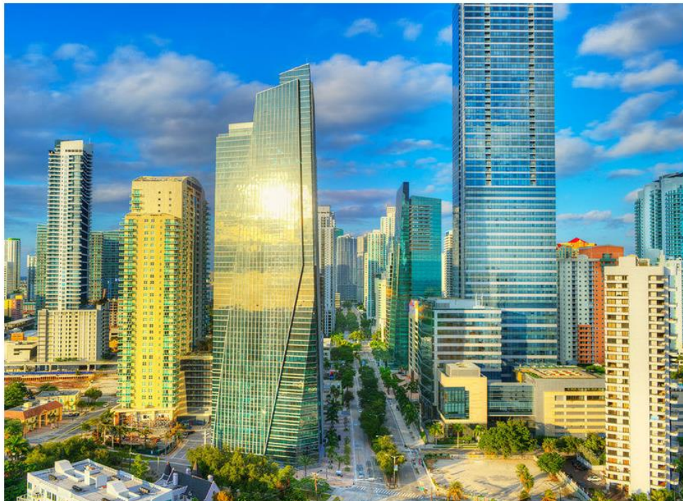
New website helps high-rise-watchers keep current on the city's shifting skyline.

The map is housed on the DDA website and will be updated quarterly as buildings are completed and new projects announced.