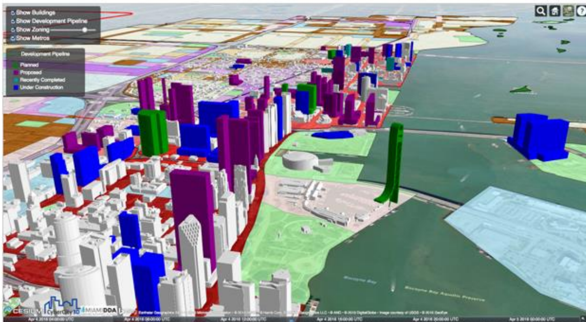
Miami Downtown Development Authority