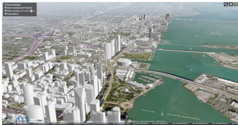
Miami's skyline in 2016.

The Downtown Miami Interactive 3-D Skyline Map can be accessed here .