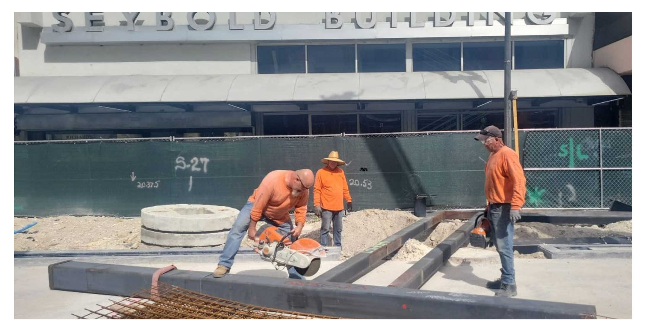
Phase D (E 1st Ave to N Miami Ave)