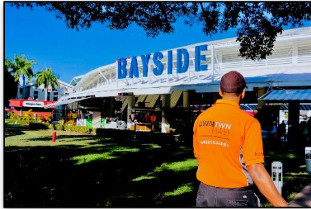
Ambassadors Assisting on Boat Tour