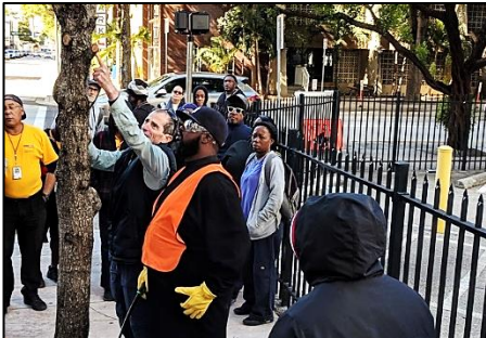
DET/CRA Proper Tree Pruning Training