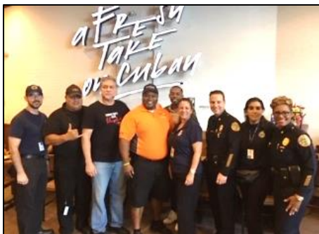
Business Community Outreach Coffee with a Cop Brickell – Sergio's