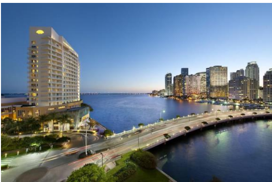
Brickell Key and Brickell MANDARIN ORIENTAL MIAMI

The Forbes five-star Spa at Mandarin Oriental, Miami is still the premier spa in downtown Miami, with a focus on oriental-inspired treatments in a truly restorative environment, along with facial treatments featuring Biologique Recherche . There are two split-level Mandarin Suites with multi-jet tubs overlooking Biscayne Bay.