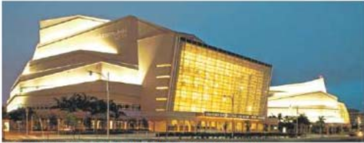
ADRIENNE ARSHT CENTER FOR THE PERFORMING ARTS