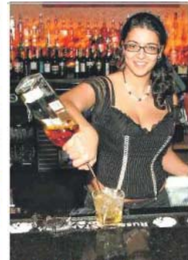
MARY BRICKELL VILLAGE